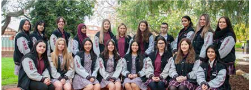
* Not all students who received an offer could be present for this photo.

Underdale staff wish all students the best for what we are certain will be very bright futures.