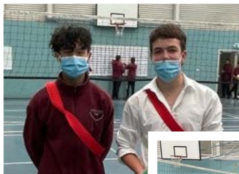
JUNIOR Courage vs Resilience 15-12, 15-12

16 September - Congratulations to the Senior Resilience team and the Junior Courage team in winning the ROCK HOUSE Volleyball tournament. Thank you to all teams participating in this term's competition!