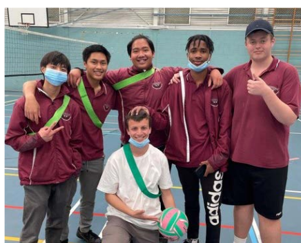
SENIORS Resilience vs Optimism 15-11, 15-12, 4-3